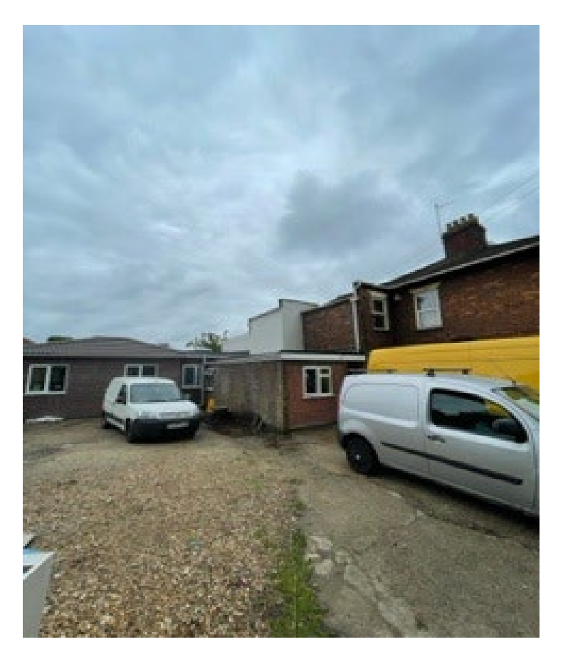
109 Tennyson Road, King's Lynn, PE30 5PA